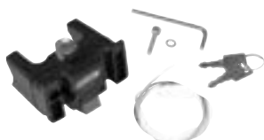
E185 Handlebar Mounting-Set with Lock

Handlebar mounting-set (sold separately):