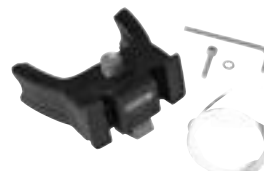
E226 Handlebar Mounting-Set E-Bike