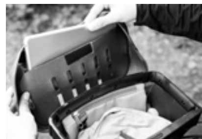
Opening lid compartment: 21,5cm / 8.5in.