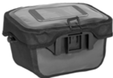
Smartphone in transparent lid compartment (not included)