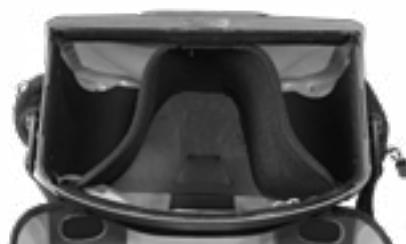
Ultimate Internal Divider (not included)