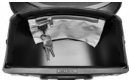
Carabiner with key chain