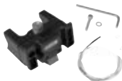
E225 Handlebar Mounting-Set