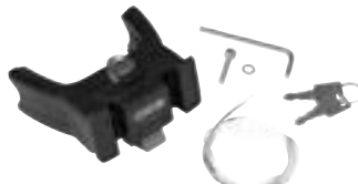
E207 Handlebar Mounting-Set E-Bike with Lock