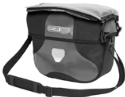
Mounting of optional accessory Ultimate Map-Case (not included)